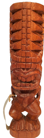
* 11. Kāne statue