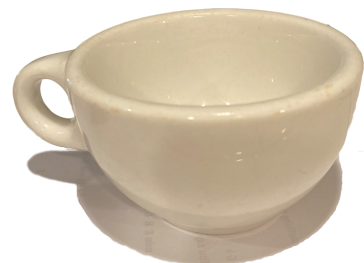
* 14. Coffee cup