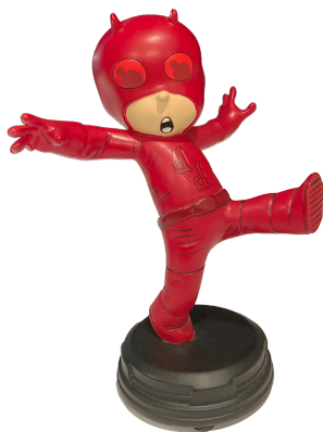
* 2. Daredevil statue

17. The Letter A: Associated with new beginnings because of its place as the first letter in the English alphabet. The capital letter has three lines. The number three, as discussed earlier, is magical. It is a number of manifestation into the material from the alchemical mixing of the soul, mind and body. “A” is the alpha before the omega.